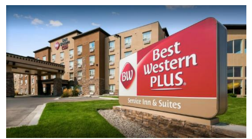
Best Western Plus Service Inn & Suites

Block bookings have been made at the following locations under the booking name: 3A Boys and Girls Volleyball Provincials.