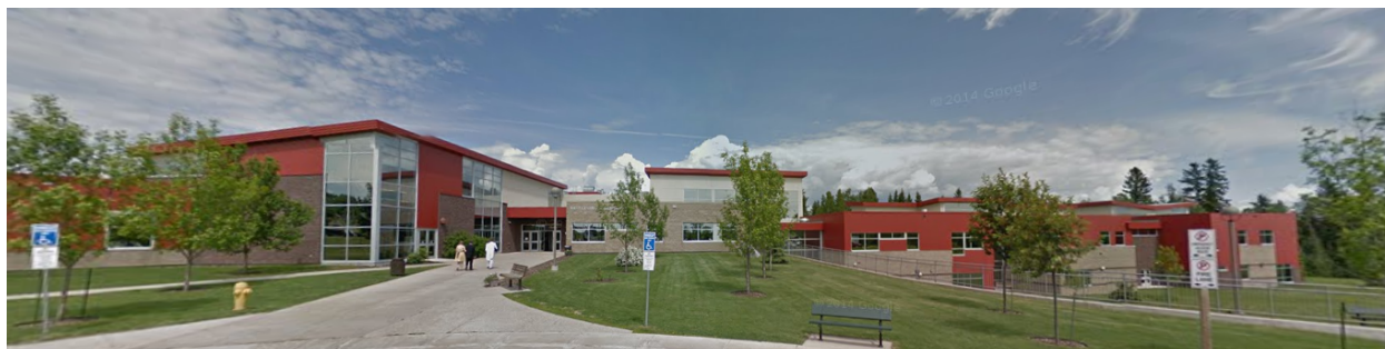
West Central High School - Rocky Mountain House, Alberta