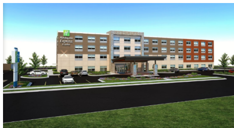
Holiday Inn Express Lethbridge Southeast

Address: 217 41 St S, Lethbridge, AB T1J 1Z3