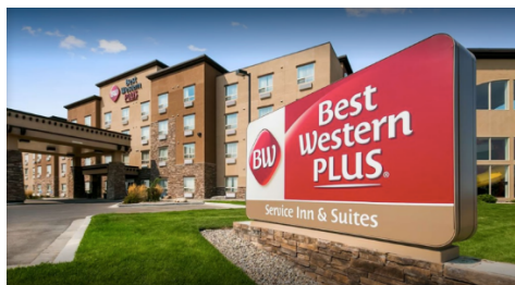
Best Western Plus Service Inn & Suites

Block bookings have been made at the following locations under the booking name: 4A Boys and Girls Basketball Provincials.